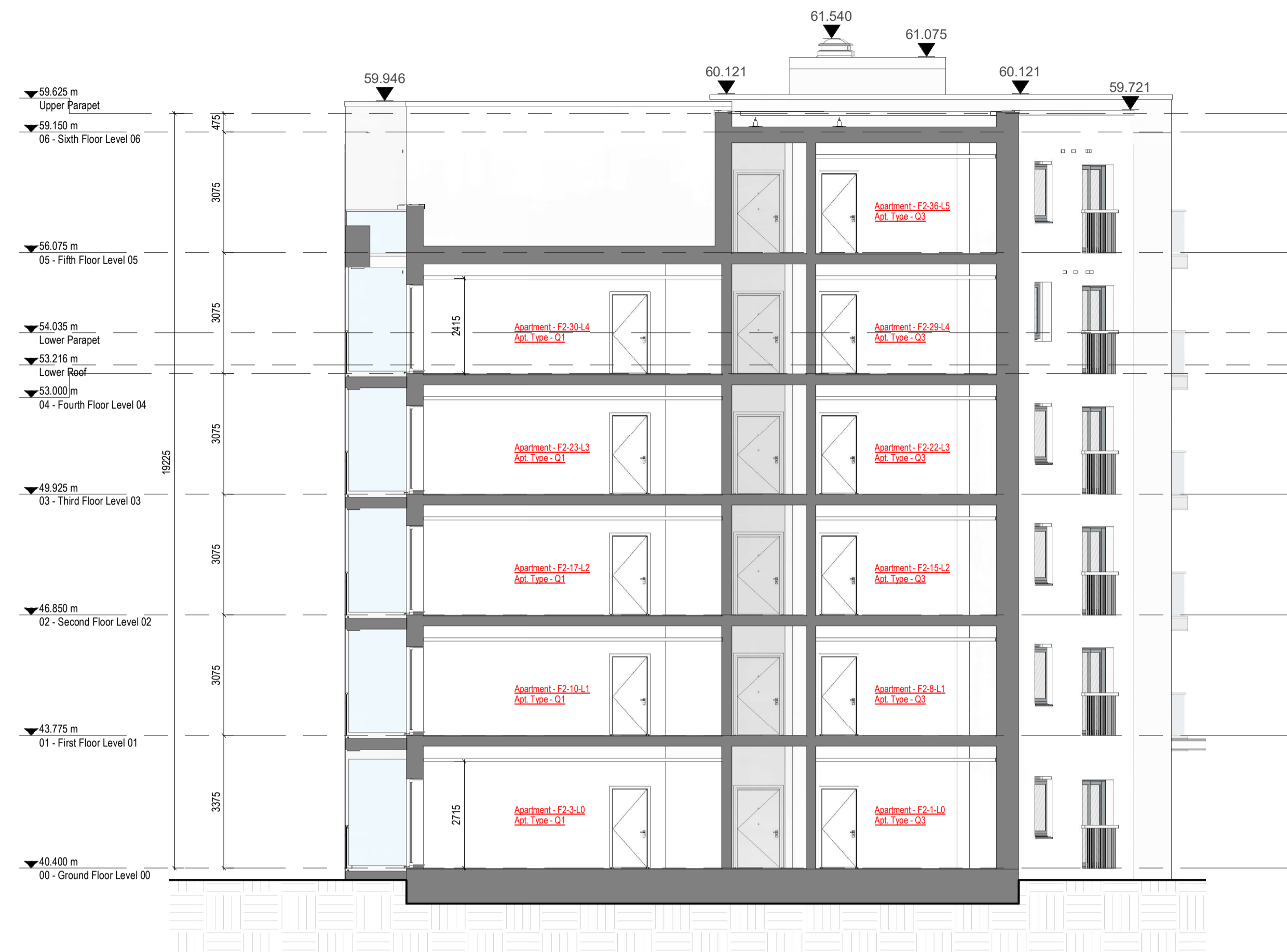
1 GA - Section BB 1 : 100